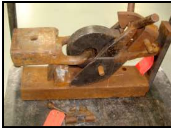
The original welded steel hitch

The cast iron bar proved to be much stronger than the steel rod. Now the challenge was to design the castings.